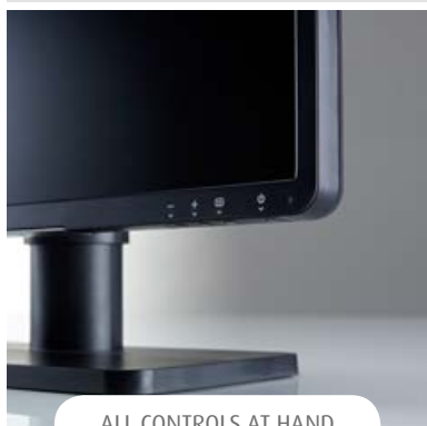
ALL CONTROLS AT HAND