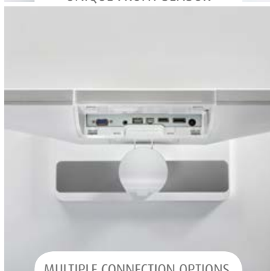
MULTIPLE CONNECTION OPTIONS

"Medical equipment surfaces can contribute to the spread of healthcare-associated infections and should therefore be disinfected."