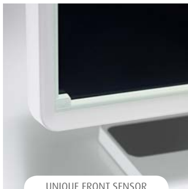
UNIQUE FRONT SENSOR